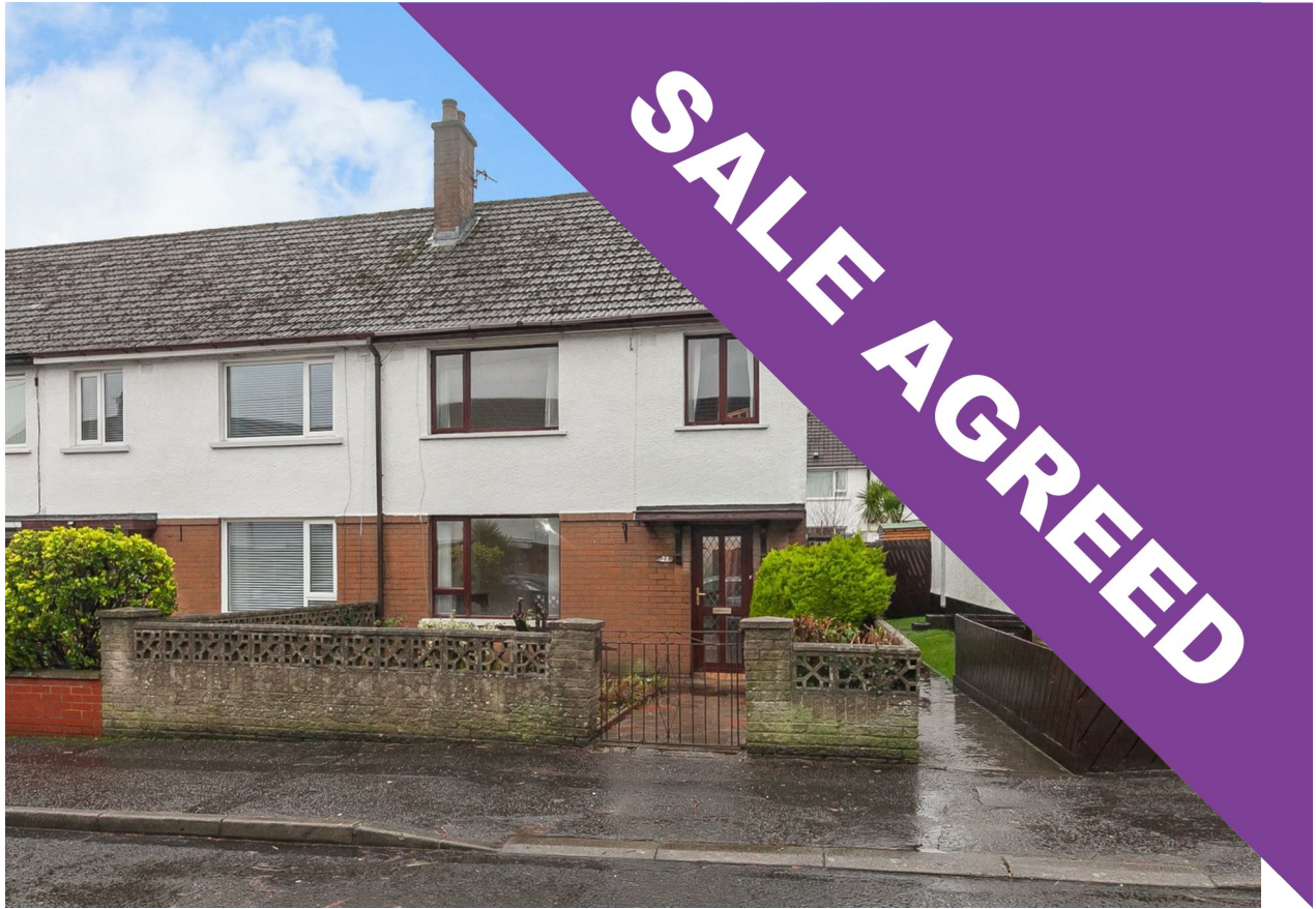
28 Kings Crescent, Newtownabbey, BT37 0DJ